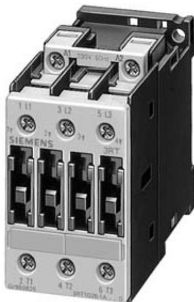
CONTACTOR, AC-3 7.5 KW/400 V, AC 24V 50/60HZ, 3-POLE, SIZE S0, SCREW CONNECTION